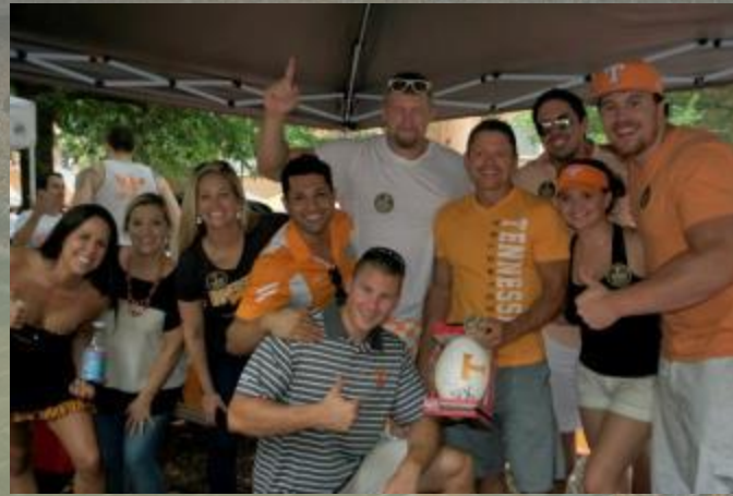
Tailgaters Caught Gathering Recyclables