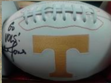
Football signed by Butch Jones (courtesy of the Volshop)