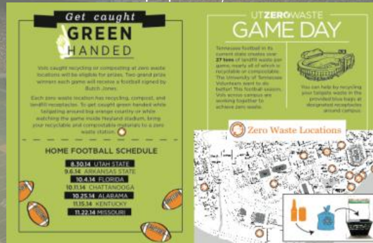
Get Caught Green Handed | Zero Waste Game Day Card