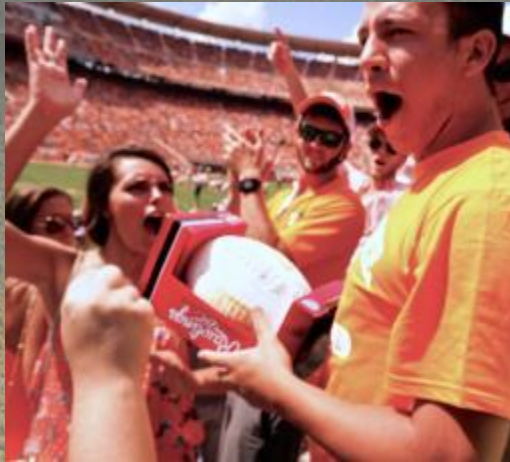
Fan Caught Recycling in Neyland