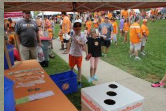
Fan playing a Recycling game