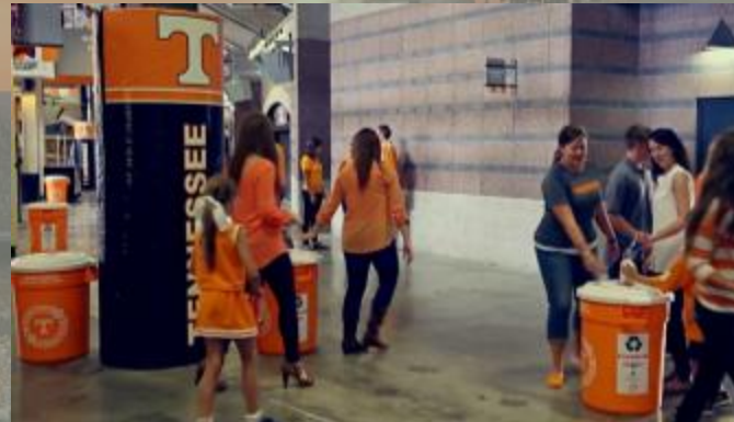
Orange and White Recycling Bins inside Neyland