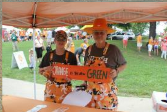
Orange is the new Green