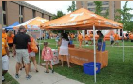
UT Recycling at Vol Village