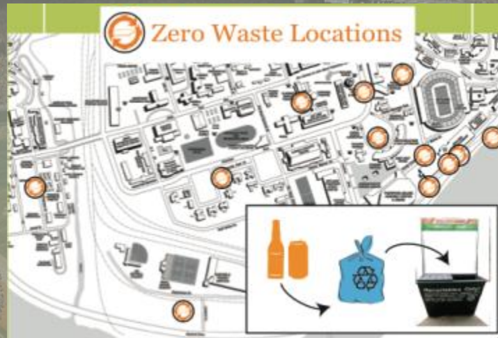
Zero Waste Locations