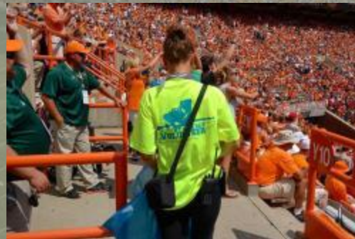
Green Team vs. Neyland