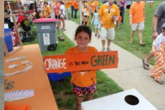
Going green early!