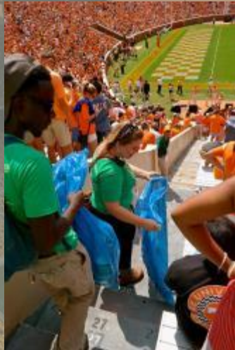
Storming the Stands