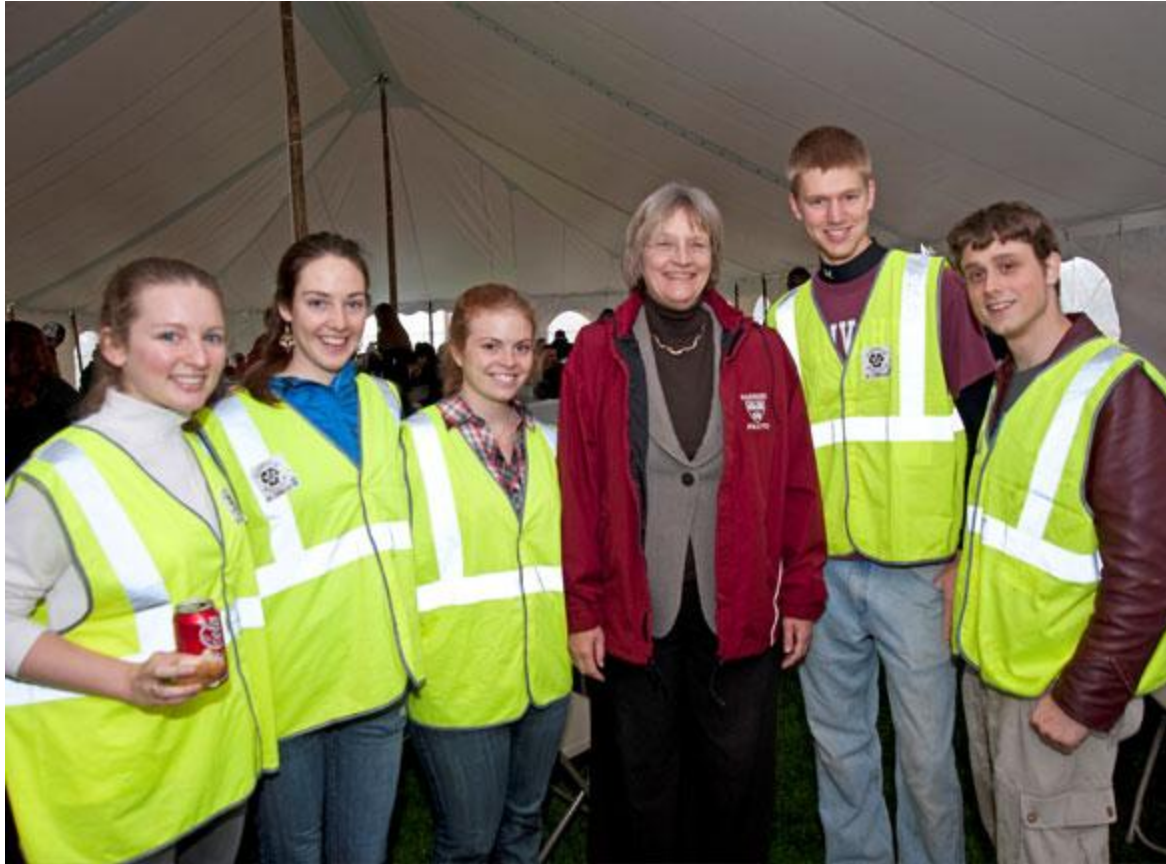
Harvard President Drew Faust with GameDay Recycling Volunteers in “Harvard Recycles” safety vests.