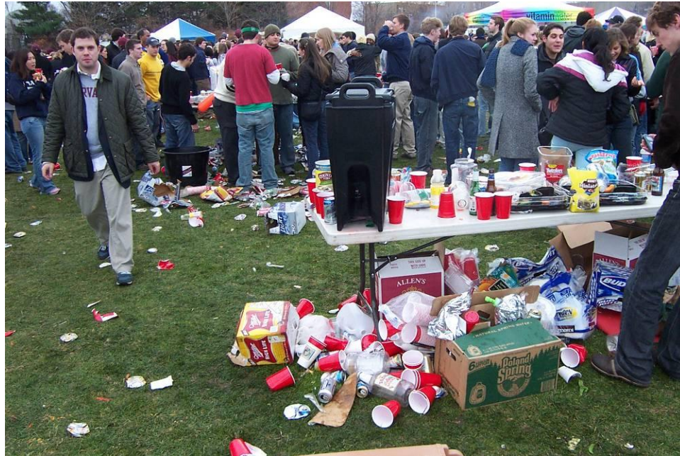
Harvard-Yale tailgate, 2004.