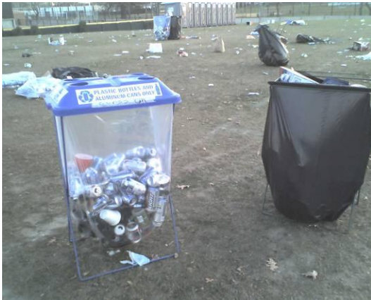
Harvard-Yale tailgate, 2008.