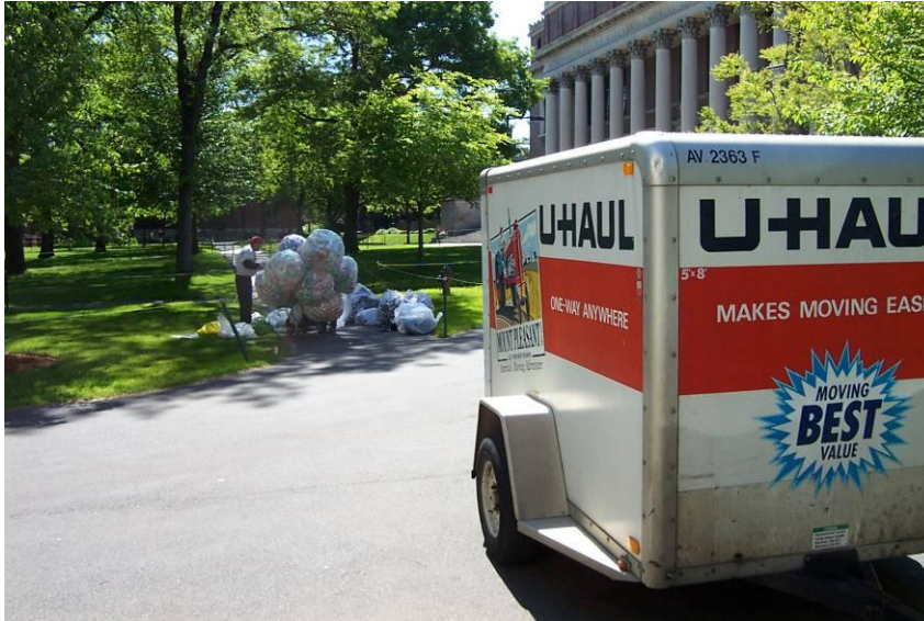
Harvard Yard scavenger.