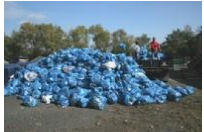
Penn State Beaver Stadium Recycling after Notre Dame game, Penn State Recycling website