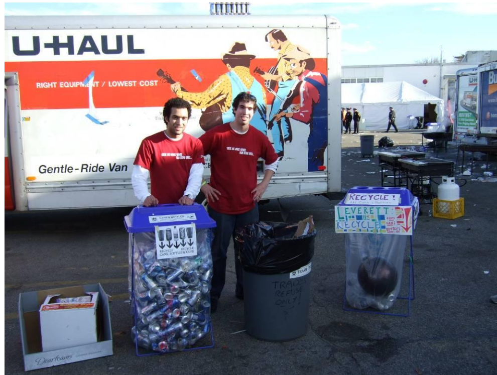
Harvard-Yale Game, 2006.